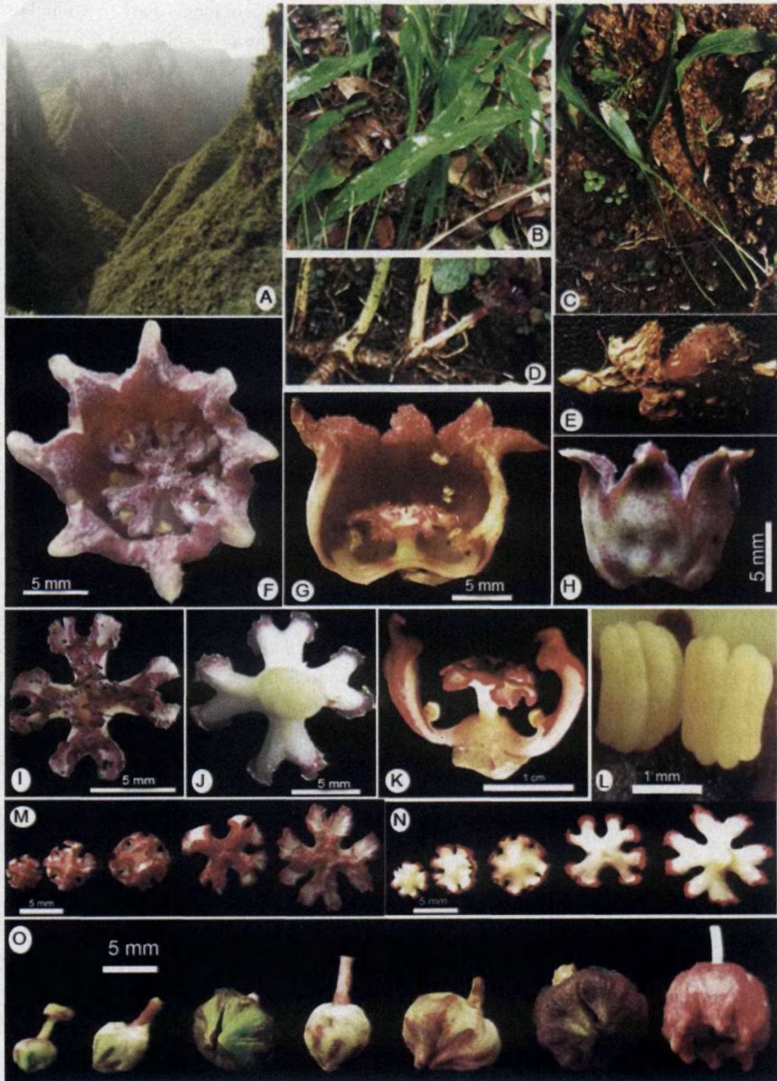
图版 I 凤凰蜘蛛抱蛋 A. 生境; B. 生境特写; C. 全株形态; D. 根茎及花; E. 浆果; F. 花正面; G. 花被纵切示雌蕊形态; H. 花被筒; I. 柱头正面; J. 柱头背面; K. 花被剖切示雄蕊着生位置; L. 花药; M. 不同时期柱头形态(正面); N. 不同时期柱头形态(背面); O. 不同时期花被筒形状。 Plate I Aspidistra fenghuangensis K. Y. Lang A. Habitat; B. Habitat, close-up view; C. Posture; D. Rhizome and flowers; E. Berry; F. Perianth, adaxial view; G. Perianth, longitudinally dissected, showing the shape of pistil; H. Perianth, side view; I. Stigma, adaxial view; J. Stigma, abaxial view; K. Perianth, longitudinally dissected, showing the position of stamens; L. Stamens; M. Stigma(adaxial view), showing the morphological variation in different periods; N. Stigma(abaxial view), showing the morphological variation in different periods; O. Perianth, showing variation in different period.