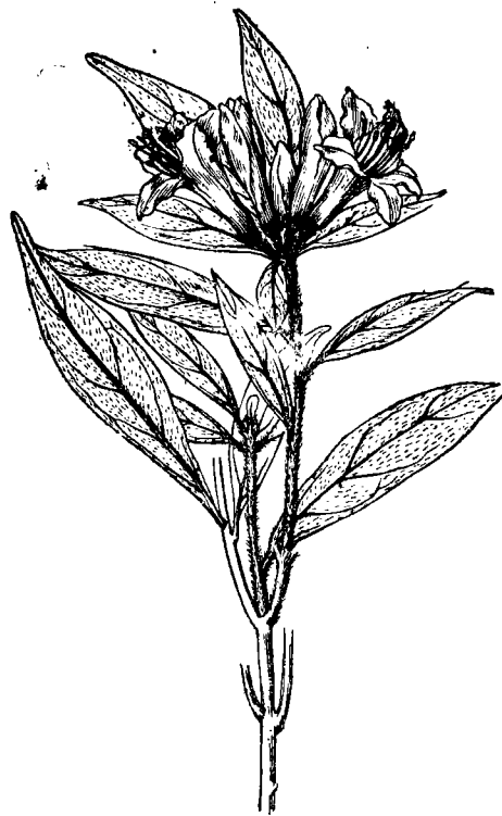
图6 长镰杜鹃 Rhododendron longifalcatum Tam (吴栋成绘)