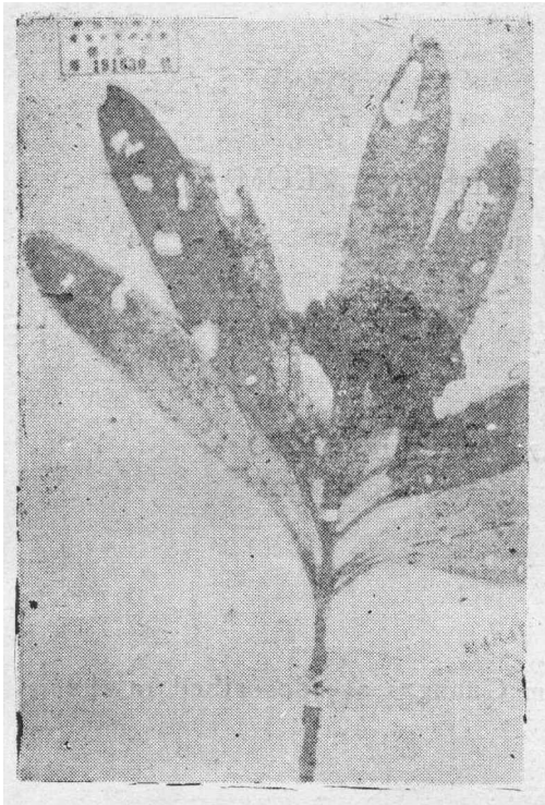
图3·防城杜鹃 Rhododendron fangchengense Tam