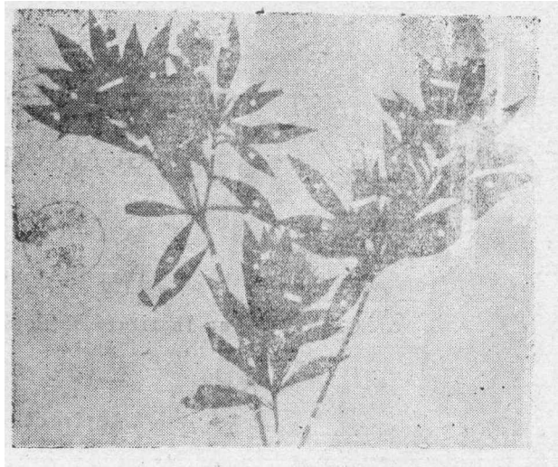
图4 南边杜鹃 Rhododendron meridionalis Tam