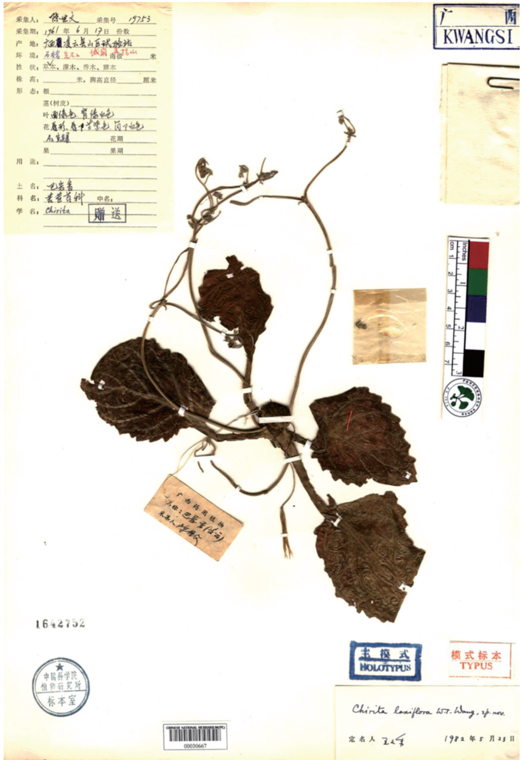
图 1 疏花报春苣苔模式标本(存放于中国科学院植物研究所标本馆, PE00030667)