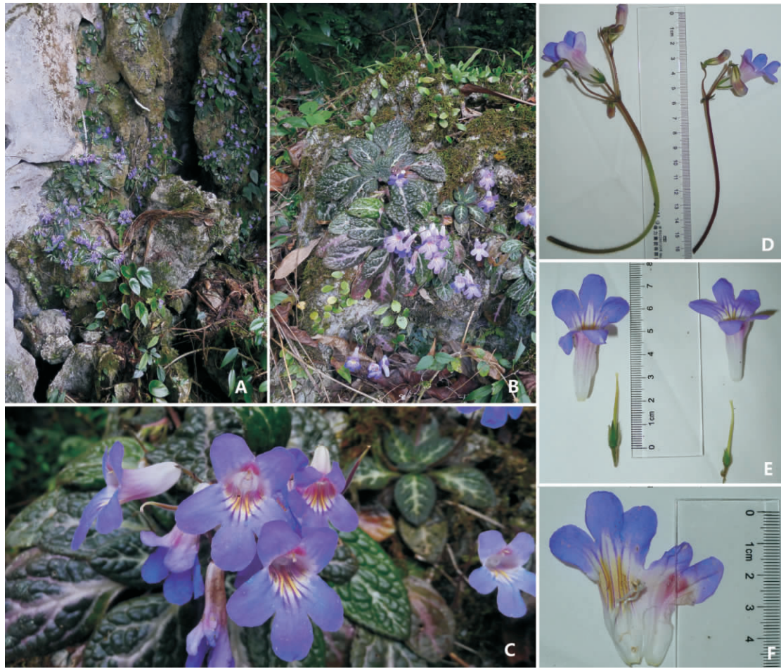
图 2 泡叶报春苣苔 A. 生境; B. 开花植株; C. 花正面观; D. 花序; E. 花与雌蕊; F. 花冠解剖。

Fig. 2 Primulina bullata S. N. Lu & Fang Wen, sp. nov. A. Habitat; B. Plants with flowers; C. Frontal view of flowers; D. Cyme; E. Flower and pistil; F. Corolla opened.